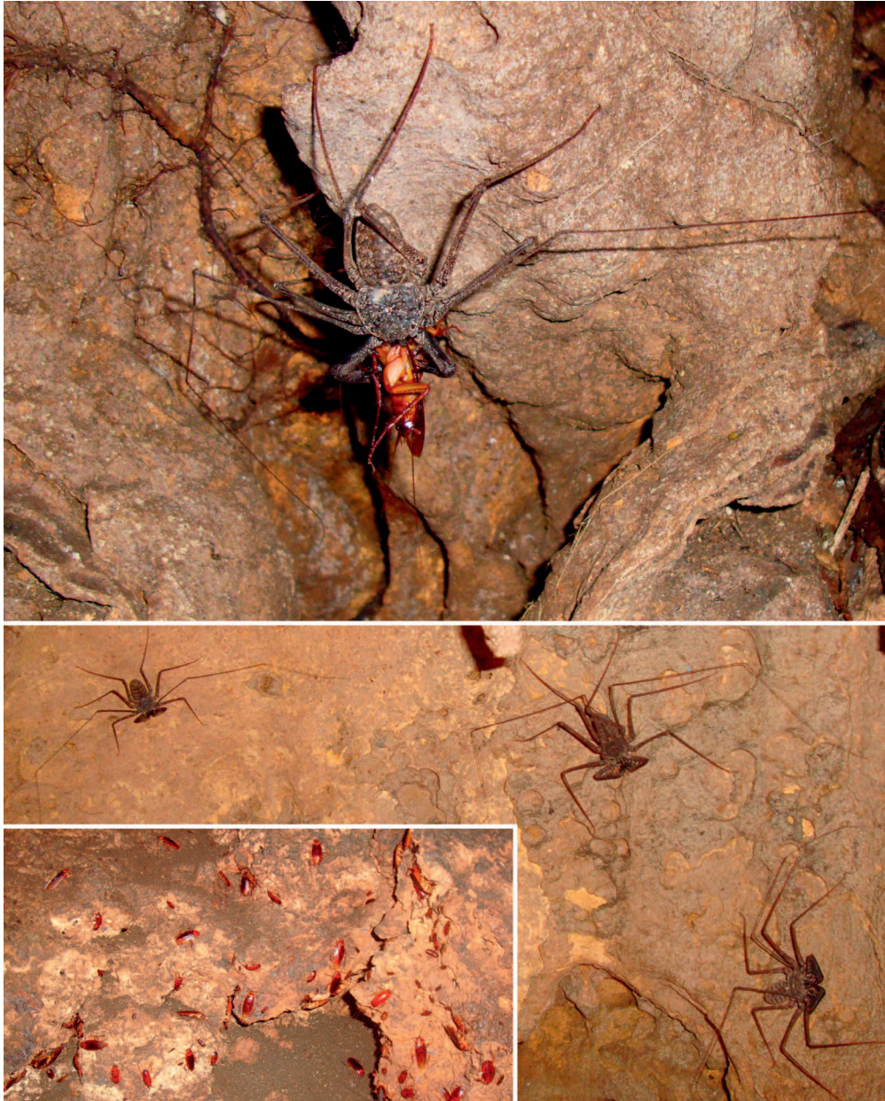
Figure 1.—The amblypygid Phrynus longipes eating a primary consumer (Blattodea; top panel) in Cueva de los Culebrones, Aricebo, Puerto Rico, USA. Increased guano deposits support more primary consumers (bottom inset), which allows for enormous whip spider populations (bottom panel).

estimator, which is an estimator similar to Lincoln-Petersen, but with less bias at small sample sizes (Chapman 1951). This estimate assumes closed populations with no birth, death, immigration, or mark loss. These assumptions are realistic for this system, since dispersal is low and surveys were conducted on consecutive nights.